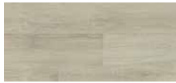
River Sand Oak