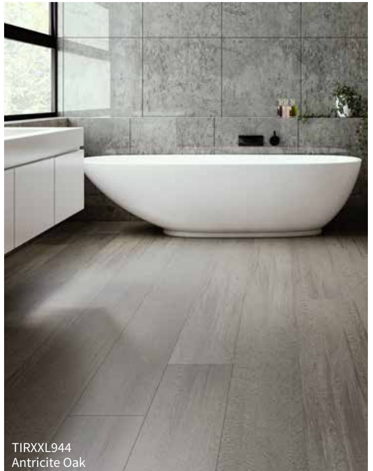
TIRXXL944 Antricite Oak