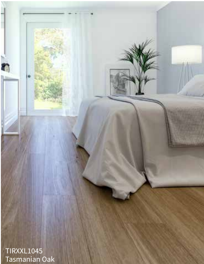
TIRXXL1045 Tasmanian Oak